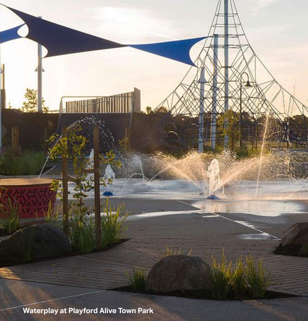
Waterplay at Playford Alive Town Park