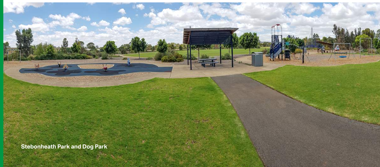
Stebonheath Park and Dog Park

bushland setting. It includes the Lake Picnic Area, the Knob Lookout, Wirra Campgrounds and the Gawler View Playground. The park has beautiful and challenging walking/hiking trails like the Devil's Nose Track and the Lizard Rock Hike. If bird watching is your thing, you won't be disappointed with colourful scarlet robins, blue wrens and eastern spine bills which visit the park.