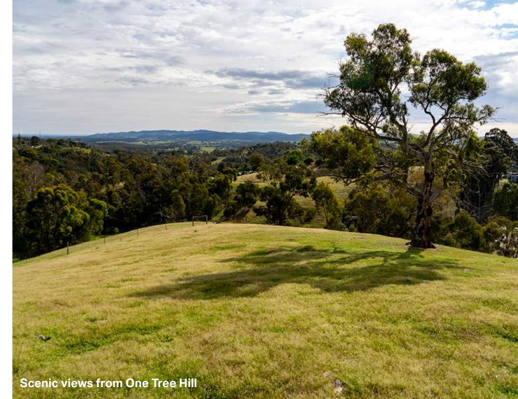
Scenic views from One Tree Hill

The northern entrance is at the corner of Two Wells Road and Weaver Road, Gawler. The southern entrance is at the end of a cul-de-sac parallel to Port Wakefield Road, Waterloo Corner.