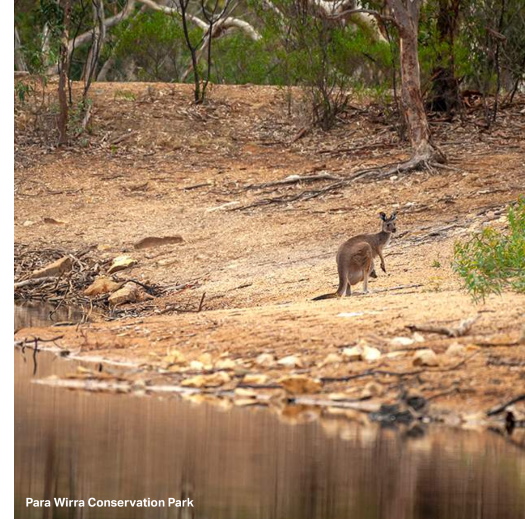
Para Wirra Conservation Park

Connecting to the park is the Smith Creek walking trail. Meet here each Saturday morning at 8 am for Parkrun. It's a great way to improve your fitness.