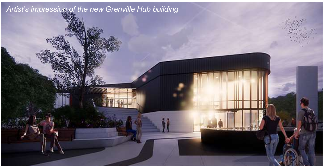
Artist's impression of the new Grenville Hub building

The same staff and volunteers are looking after customers and delivering the usual services in the new location.