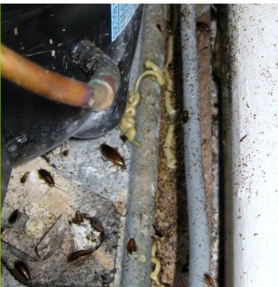
Cockroach infestation behind a hot water service