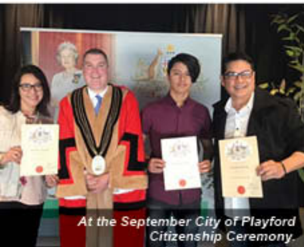
At the September City of Playford Citizenship Ceremony.