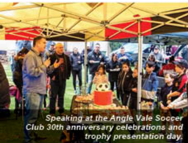
Speaking at the Angle Vale Soccer Club 30th anniversary celebrations and trophy presentation day.