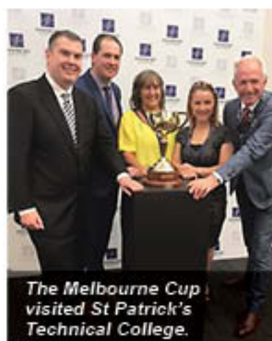
The Melbourne Cup visited St Patrick's Technical College.