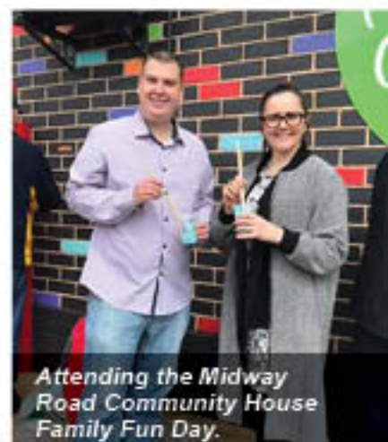
Attending the Midway Road Community House Family Fun Day.