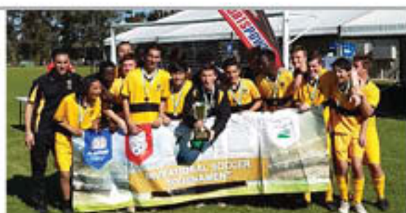
St Paul's College (Year 10 Boys)

The tournament is a collaboration between the City of Playford, Adelaide United Football Club and Playford International College.