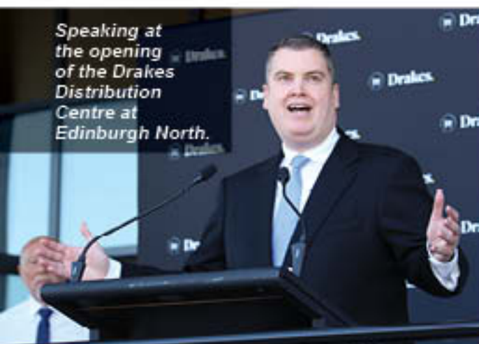
Speaking at the opening of the Drakes Distribution Centre at Edinburgh North.