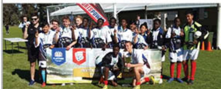
Playford International College (Year 8/9 Boys)