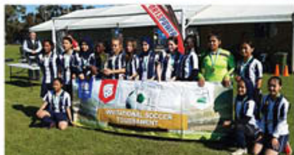
Roma Mitchell Secondary College (Girls)