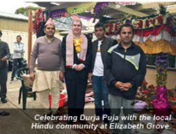
Celebrating Durja Puja with the local Hindu community at Elizabeth Grove.